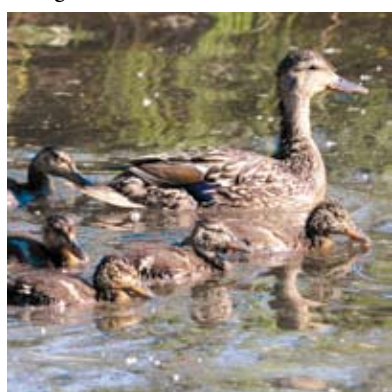
Mallard Hen & Ducklings